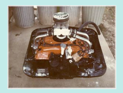
Why has this recently rebuilt motor been placed in front of a row of trashcans?