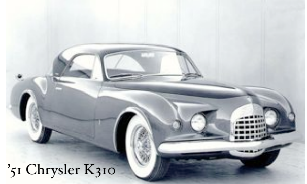
'51 Chrysler K310