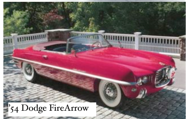
'54 Dodge FireArrow