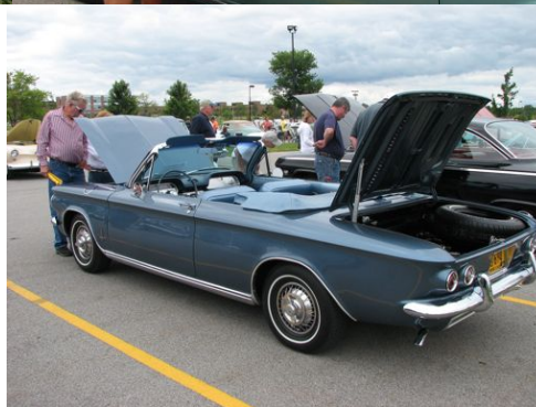
Future Corvair Drivers in Jack & Pat Greco's '65