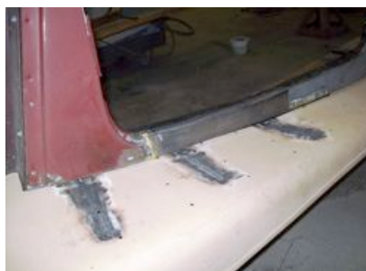
Modification to left front fender