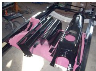
Frame & other parts after painting