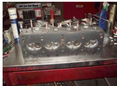
Top end of the Triumph engine