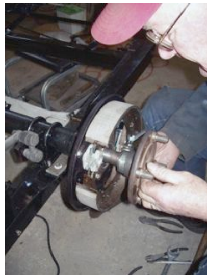
Gil assembles rear axle