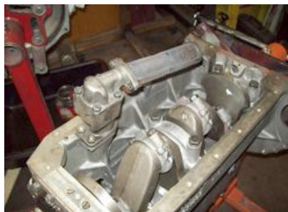
Bottom end of the Triumph engine