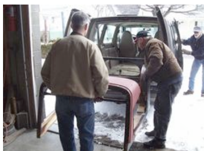
Body delivered to CARS Plus