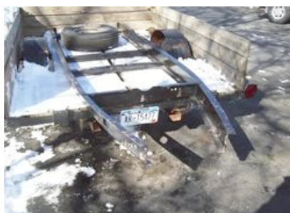
Frame going to Miller's Sandblasting