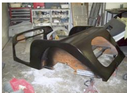
Body in primer