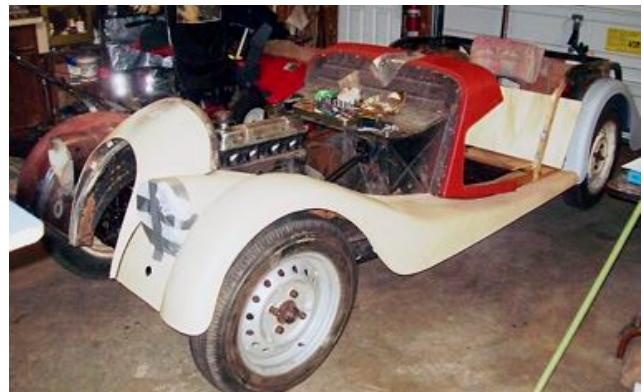
Body restoration nearing completion