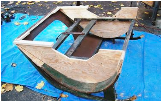
New wood in the rear fender wells