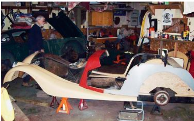
New wood and metal, October 12, 2008