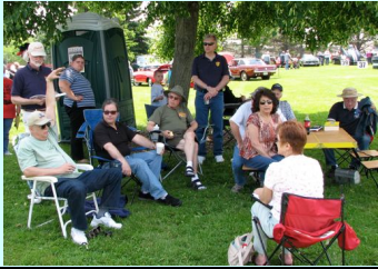
Auto Festival 2011