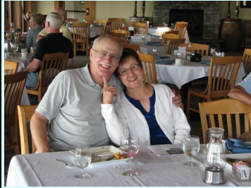
Our President and her support staff.