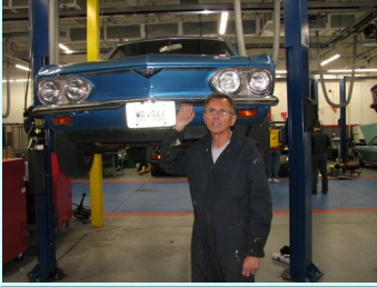
MCC Tech Session 2010