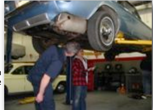
No more points here. '64 Monza Coupe