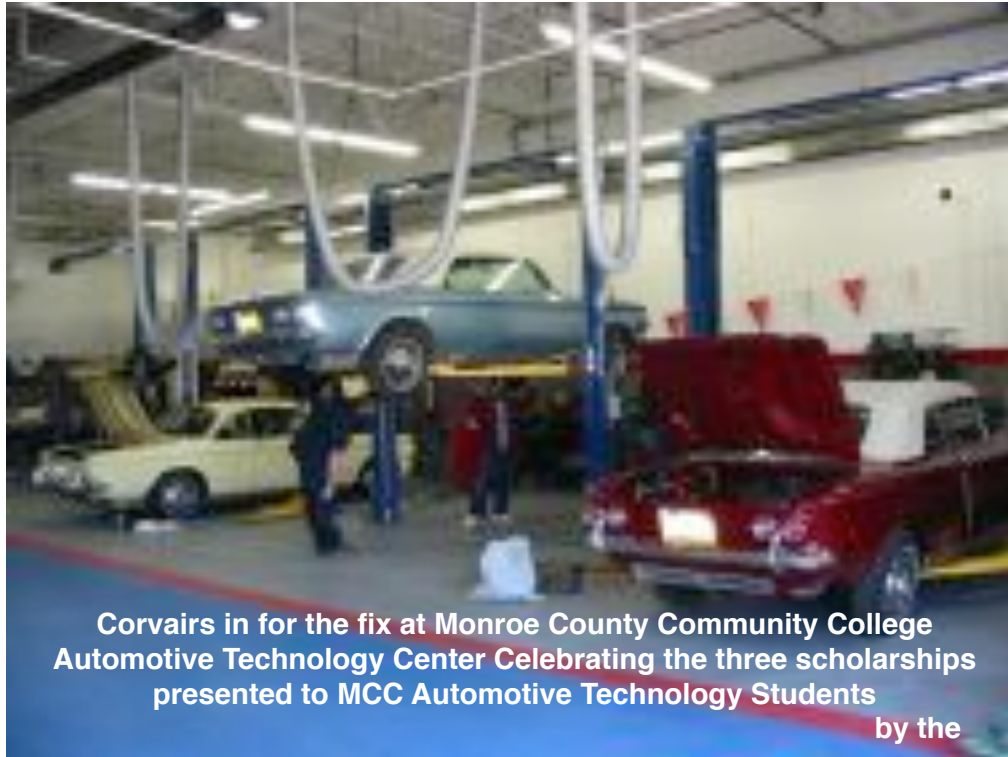
Corvairs in for the fix at Monroe County Community College Automotive Technology Center Celebrating the three scholarships presented to MCC Automotive Technology Students by the