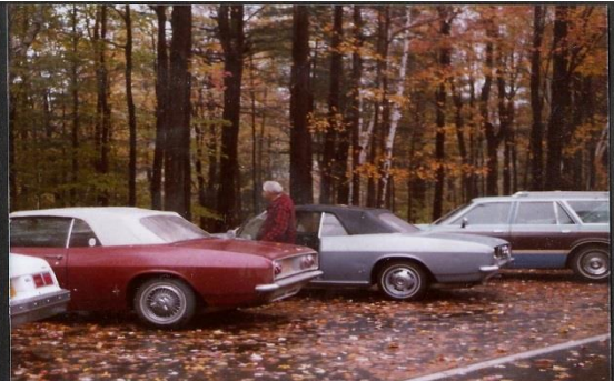
GRAND CANYON OF PENNA.