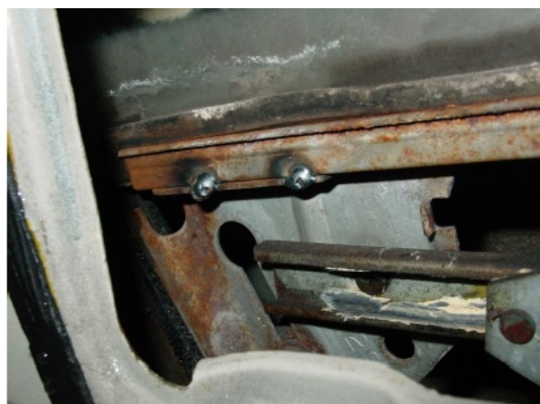
This is the rear mount reinforced.

Before starting, you may need to acquire the waterproof door paper if yours is original and be sure to use a can of spray grease to lube anything that moves.