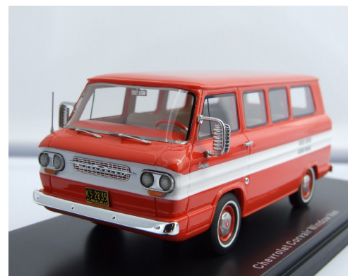
A greenbrier model by NEO.