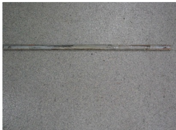
This is the lower sash channel that will bend if the window is forced with the crank.