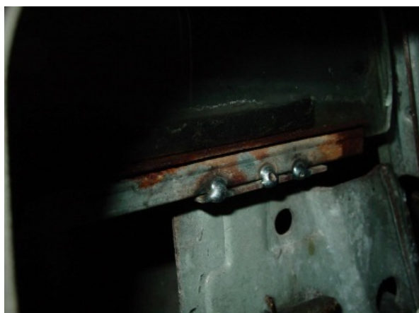
This front mount is now repaired.