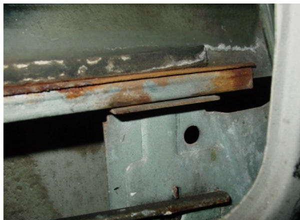
The bottom of the window is spot welded to the channel slide and will break loose.

Pictured below is one of the 2 areas where the spot welds break (front and rear channel slides). Pulling the door panel allows access by adjusting the window height. Small welds done one at a time with quick cooling (water soaked rag) will cure (or prevent) the problem. Have a waterproof door paper on hand (Clark's) as it is usually bad.