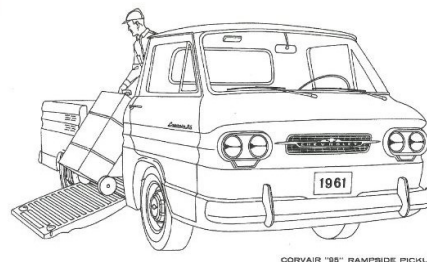
CORVAIR "95" RAMPSIDE PICKUP

May 20-21, 2022 PCCA Hosts the CPF Corvair Museum Event