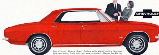
The Corvair Monza Sport Sedan with eight safety features like seat belts, front and rear now standard. Always buckle up.

Awe for its great rear-engine traction. Buy one now and you'll like it so well you might want to buy another one in '67!