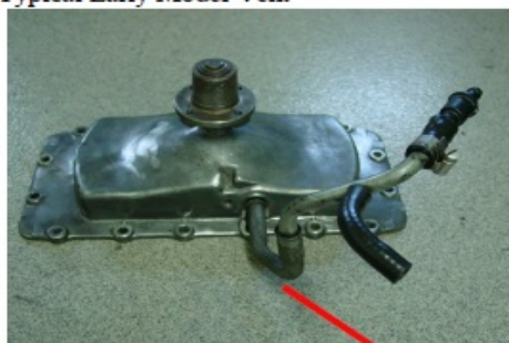
Typical Early Model Vent