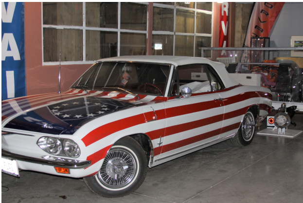
The flag car repainted back to its original glory days .