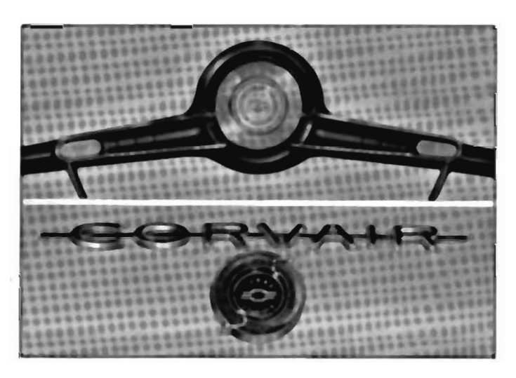
Fig. 3—Turbocharger Emblem