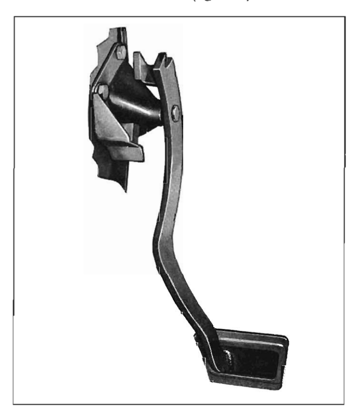
Fig. 68-1—Clutch Linkage

The clutch pedal over-center spring was eliminated on late 1961 and 1962 models (fig. 6B-1).