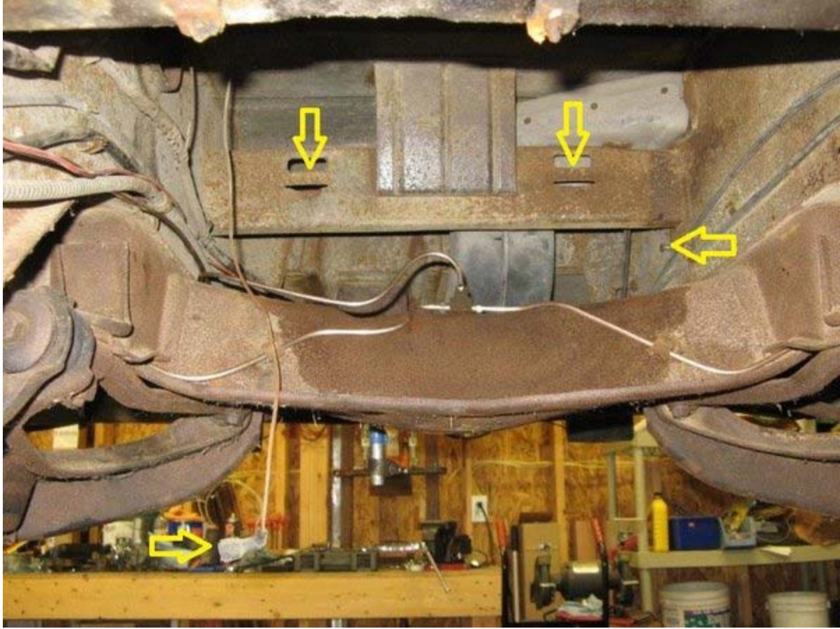
In the picture above you can see, the tank sending unit wire connector, where the tank straps hook up, and where the ground wire goes.