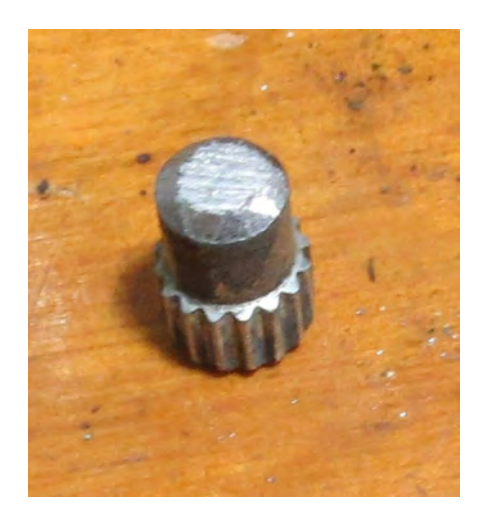
The new spline was beveled in order to allow a little more surface to make the weld a little stronger.