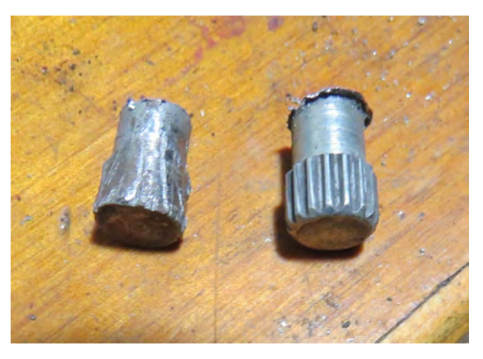
From the step out, the Corvair splines were exactly the same length.