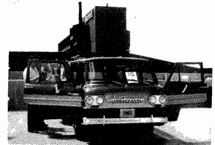
"10" 1963 GREENBRIER Modified Tom Schrum Glendale, Ariz