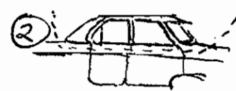
cut on dotted line