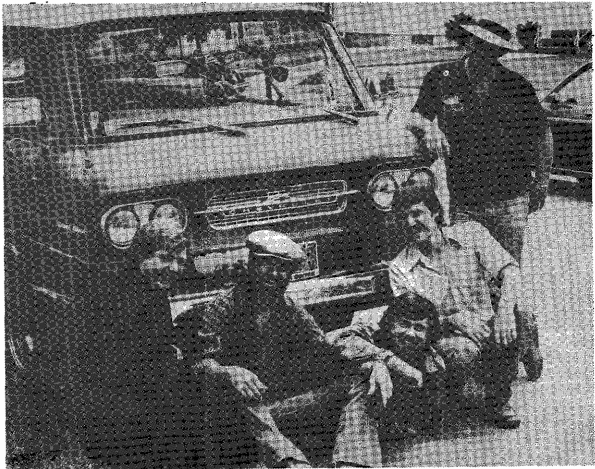
Illustration: Chevrolet Motor Division