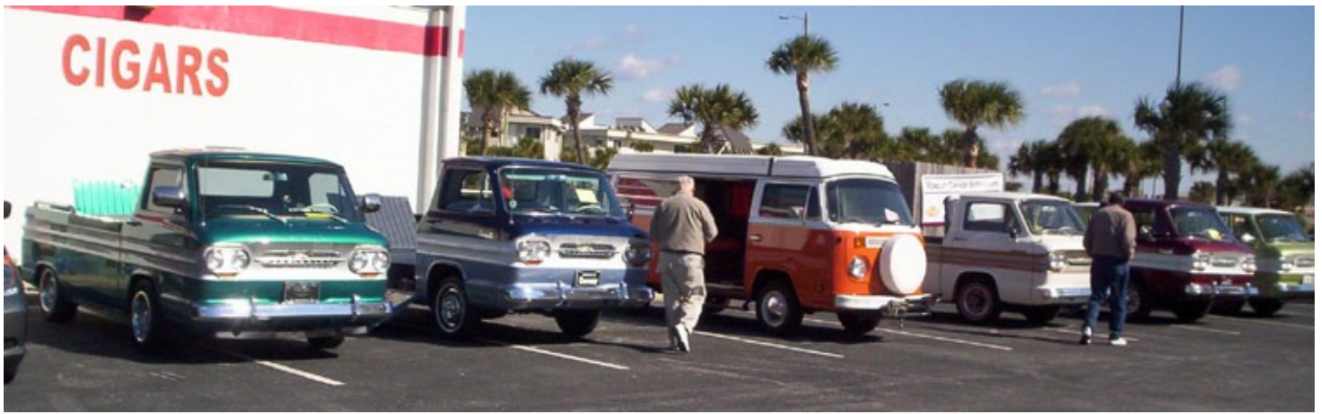
Above: FCs at the Corvair Lovers Holiday