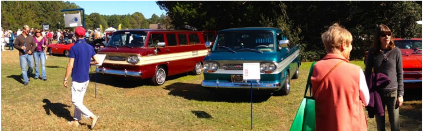
Below: FCs at the Hilton Head Island Concours