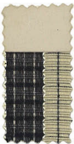
FAWN - REGULAR PRODUCTION GREENBRIER