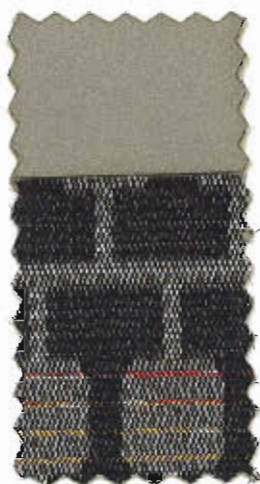
FAWN GREENBRIER DELUXE - INTERIORS ARE PART OF RPO Z60.