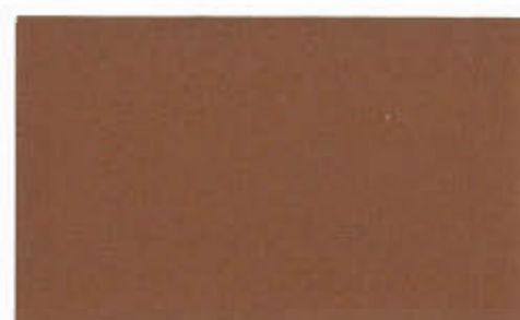
TIGER GOLD - RPO 524