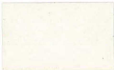
CAMEO WHITE - RPO 526