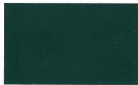
WOODLAND GREEN - RPO 505