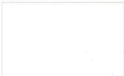
PURE WHITE - RPO 521