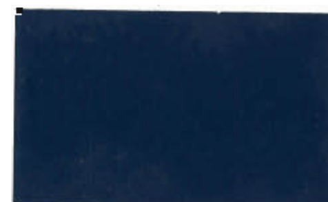
BALBOA BLUE - RPO 508