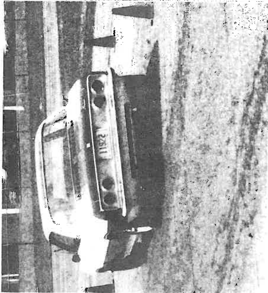
Cover: Tiger I, driven by Jim Artzberger, snakes through the slalom course at convention '82, Syracuse, N.Y.

NOTICE: Parts from Club car will be auctioned off at Meeting.