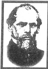
John Augustus Roebling

In 1832 John Augustus Roebling, along with a number of other German immigrants, traveled some 15 weeks to reach the site of what is now Saxonburg, Pennsylvania.