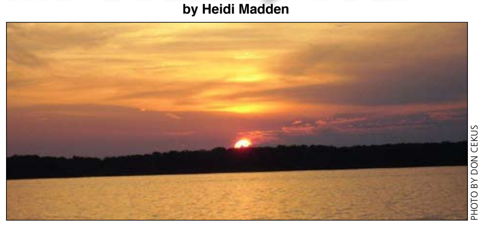
The wine tasters were treated to this sunset at a bay along Lake Erie waters

Courtyard Wineries our second stop was opened in 2010 by several wine enthusiasts with a vision of producing high quality wines to please everyone. They offered wines such as Riesling, Cabernet Sauvignon, Ruby's Rouge, Dazzle and Radiance.