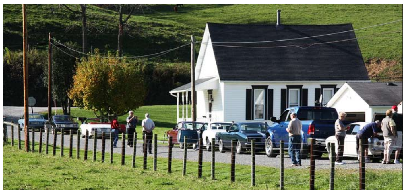
The covered bridge group takes a break to stretch their legs and enjoy the beauty of rustic Greene County