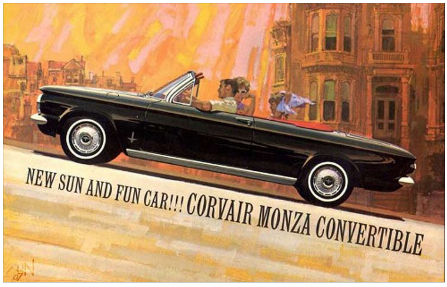
Of all the many beautiful, painted pieces that were created as Corvair advertising, this is my personal favorite. The shiny black 1962 Corvair is contrasted against an earthy and pastel colored background. What a beautiful way to show a beautiful automobile! Makes a person want to forget the winter blaahs of Pittsburgh and think about spring.