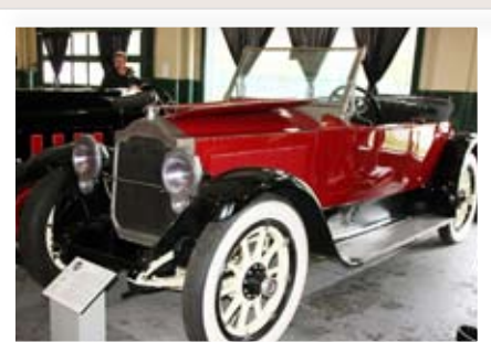
1918 Packard Twin Six Runabout Model 3-35 at the Packard Museum