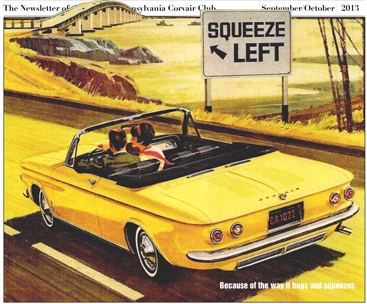
1964 Corvair Monza Spyder Convertible