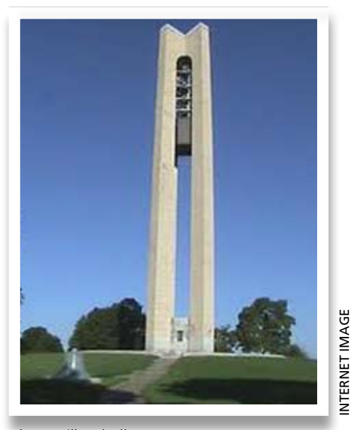
The Carillon bell tower at Dayton's Carillon Historic Park