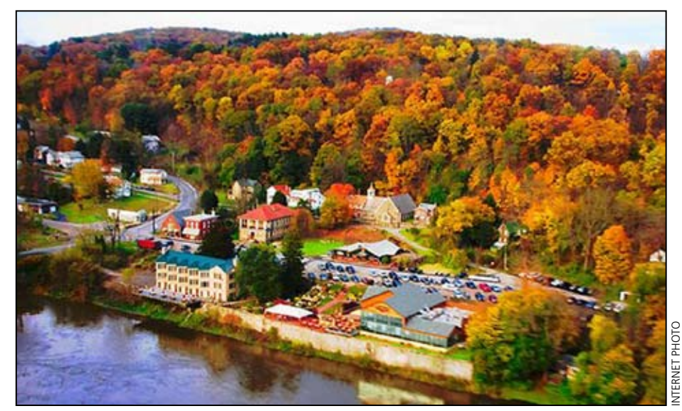
Foxburg from the air