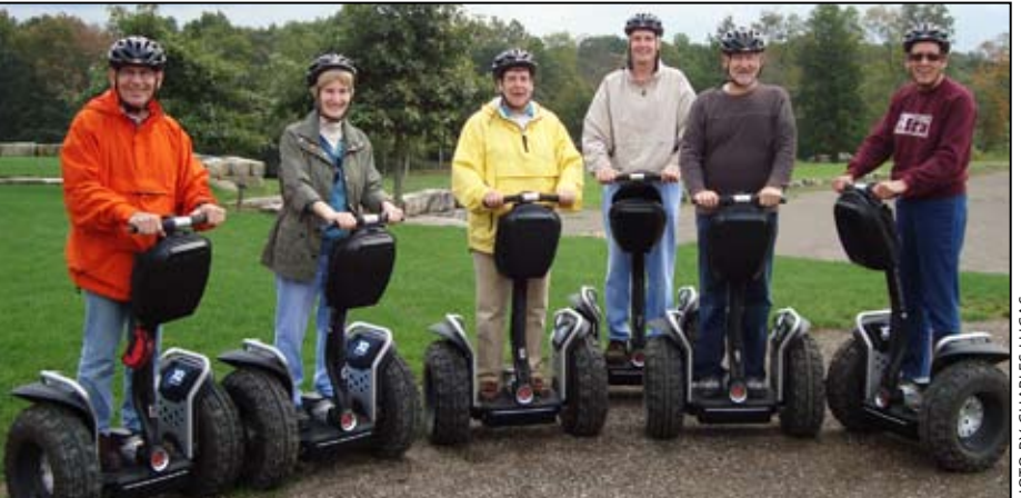
Our Segway tour group this past September