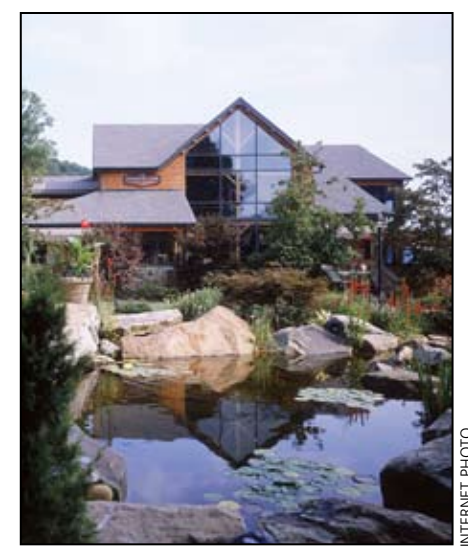
The Allegheny Grill

Foxburg could be a great destination for a spring or summer event in 2012.