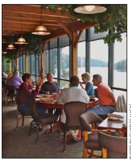
Our Segway group inside the Allegheny Grill